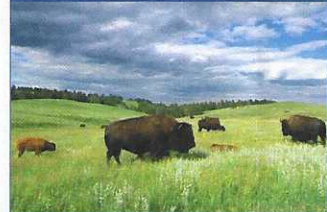
Wildlife enhances the pristine Black Hills