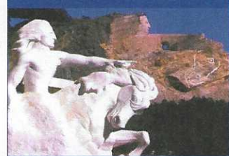
Crazy Horse Monument to be 10x the size of Mt. Rushmore