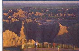
Spectacular Badlands National Park